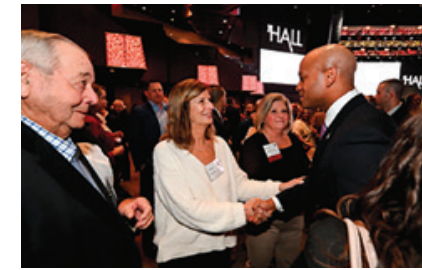
We have been busy making sure our members are fully represented