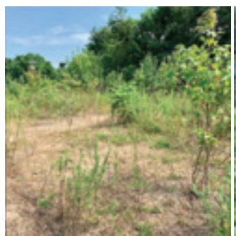
Right-of-way sprayed with traditional select herbicides to keep certain vegetation controlled.