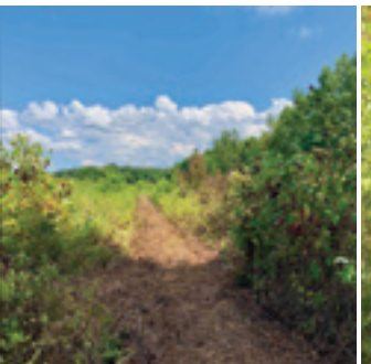
This was where the goats were placed at the beginning of the project.