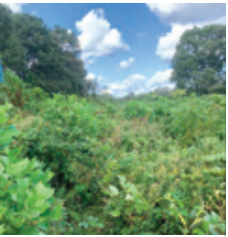
This is the same field after a year.