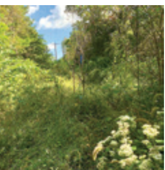
This is the same field after the study was completed.