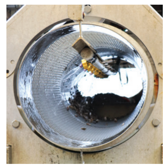
Separating the oysters by size, the tumbler is an important piece of Fallen Pines's equipment