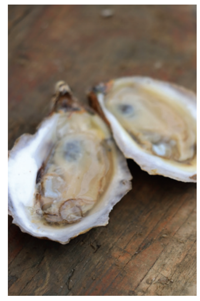
Fallen Pine's end product makes it all worth it