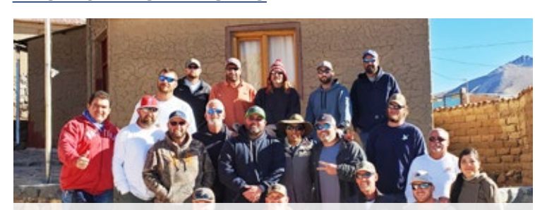
Committed to Community Pg. 19