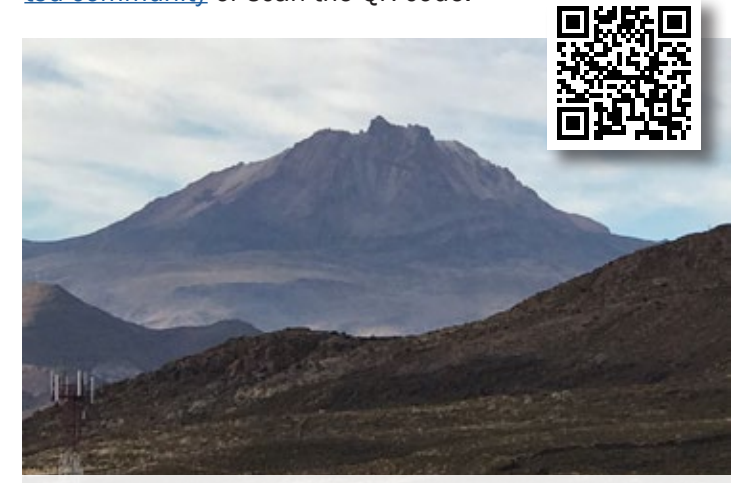
According to local knowledge, the volcano in the distance has not been active since the 1600s.

To view full pictures and video coverage from Johnson's experience, visit <a href="https://choptankelectric.com/committed-community">https://choptankelectric.com/committed-community</a> or scan the OR code: