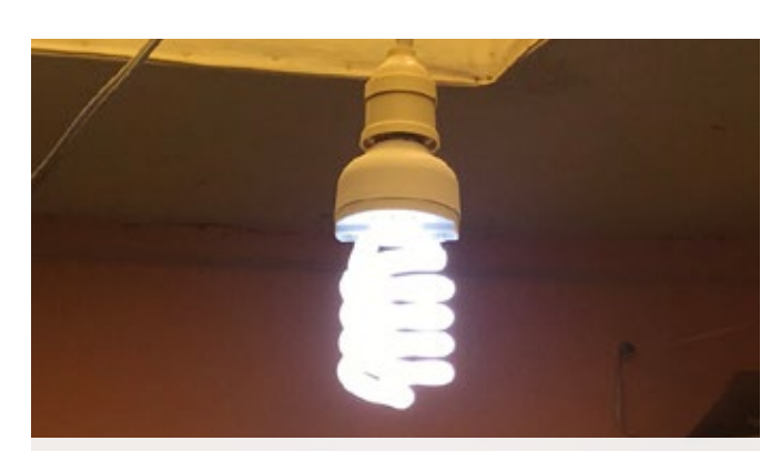
The first bulb! Imagine living in a world without electricity, and seeing it for the first time.