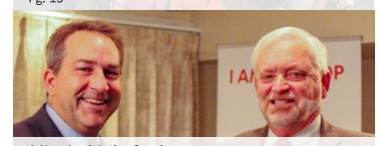
A New Legislative Session Pg. 21