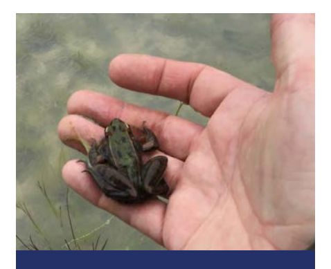
A leopard frog found at the site.

The project is expected to reach completion this fall, pending approval from the Maryland Department of Environment and the Environmental Protection Agency.