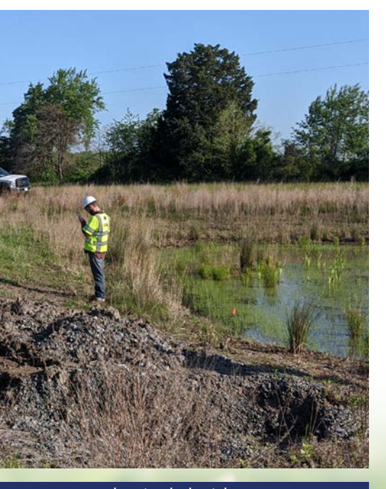
Site conditions as of April 2020, typical in spring with higher water levels before vegetation blooms.

Building wetlands out of farmlands brought its own set of issues that included digging to reach the pond, rain delays, and added rain drainage that was difficult due to the water tables. Some of the