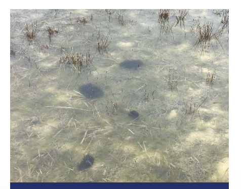
Frog egg masses seen throughout the site (black masses).