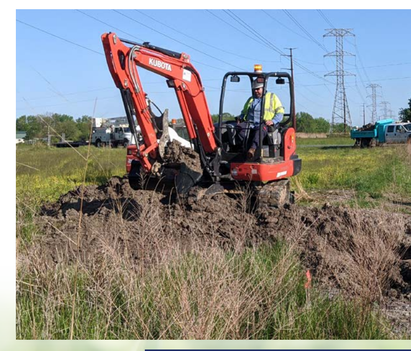
Choptank Electric Cooperative

"Often when people try to compensate wetlands,