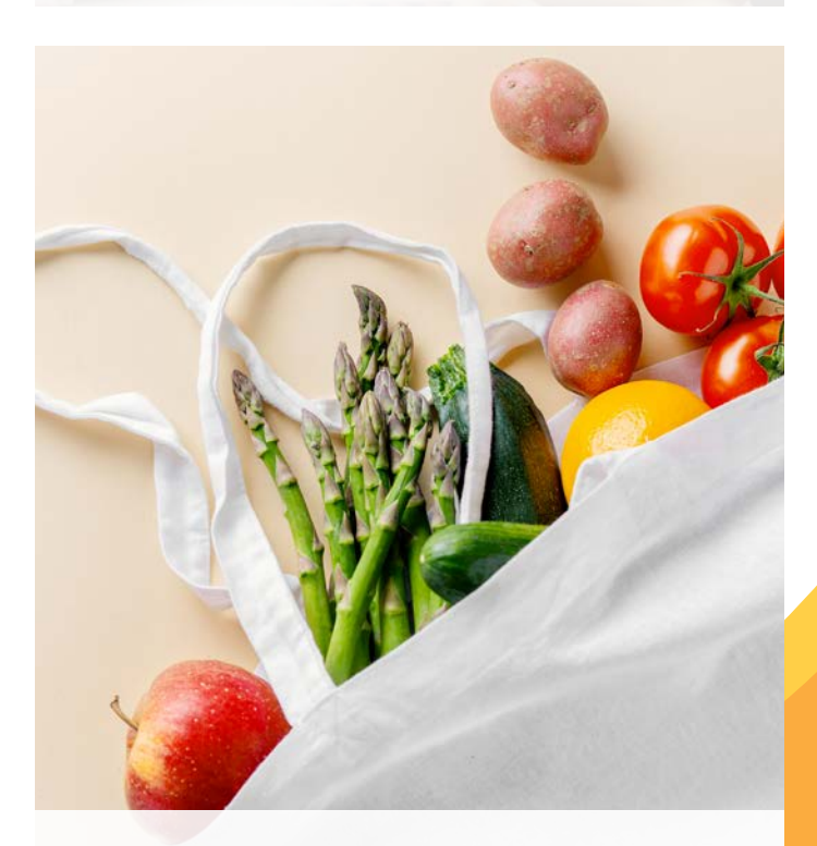
Download grocery coupons to save while shopping online or in-store.