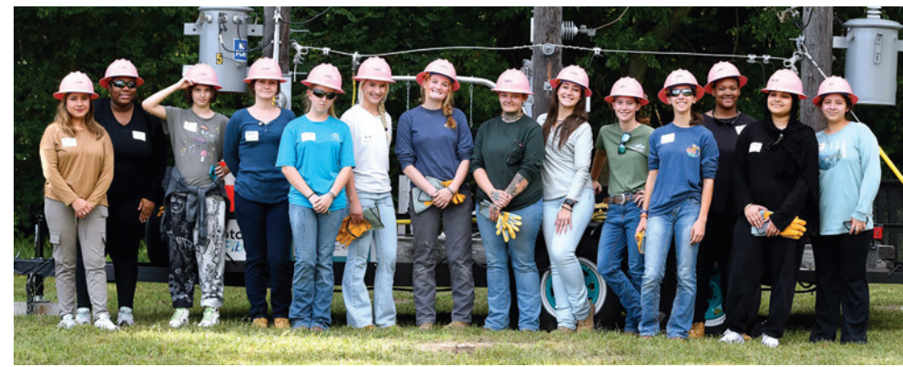
Girl Power participants at our Regional Service Center's Training Yard in Salisbury, Maryland

“Girl Power is a significant event for local workforce development and the future of our industry as it opens new opportunities for young women in our community,”