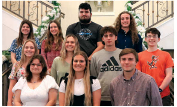
2024 Luck of the Draw Winners

The Luck of the Draw Scholarship is awarded by randomly selecting student applications from a live drawing at the end of our annual meeting. To enter the drawing, students must fill out the application and answer a ten-question quiz based on a Cooperative article in the application.