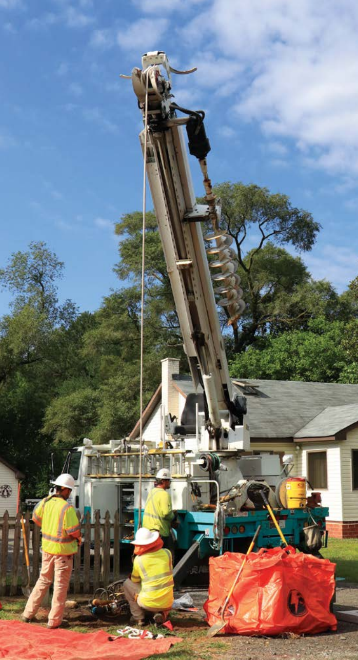
Choptank crews doing work to strengthen our power grid in Denton earlier in the summer. Improving our grid keeps the lights on and the cost affordable.