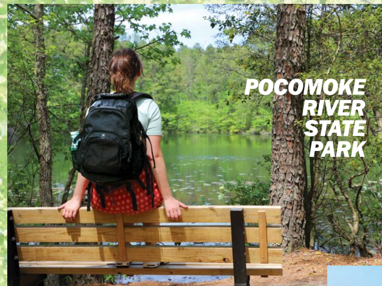
POCOMOKE RIVER STATE PARK

It's easy to get out there and find peace and quiet while taking in all that the Pocomoke River State Park has to offer. The Pocomoke River runs south from the Great Cypress Swamp in Delaware for 60 miles until meeting up with the Chesapeake Bay.