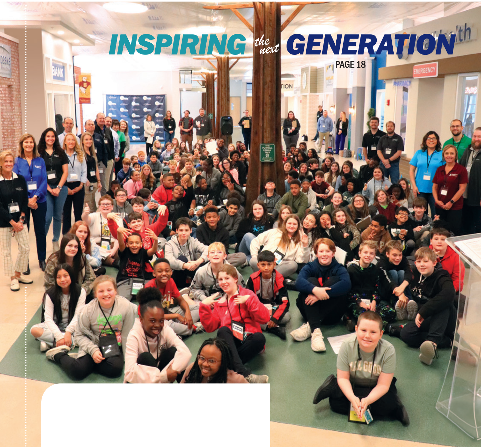
Choptank staff took over the Junior Achievement Center in Salisbury to inspire 125 Colonel Richardson 6th grade students.

For changes of address, please contact Choptank Electric Cooperative.